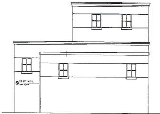
B1 REAR ELEVATION SCALE 3/8" = 1'-0"