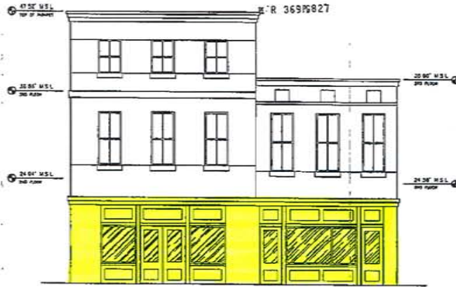
B4 MEETING STREET ELEVATION SCALE 3/8" = 1'-0"