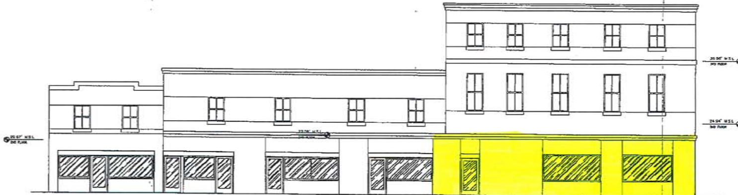
A1 WENTWORTH STREET ELEVATION SCALE 3/8" = 1'-0"