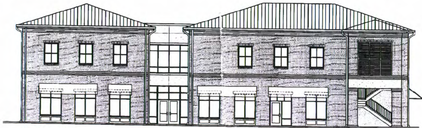
REAR ELEVATION SCALE: 1/4" = 1'-0"